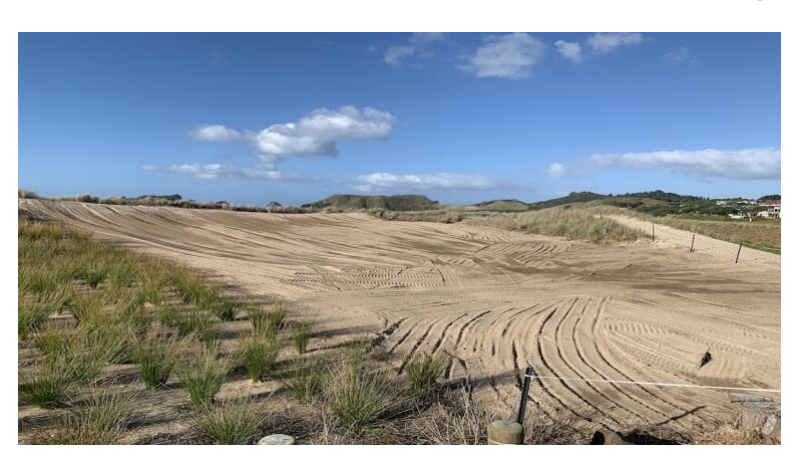
DUNE CLEARED READY FOR PLANTING